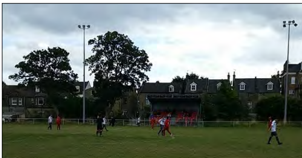
Action At The Old Spotted Dog : London Bari v Stansted (1-1)

The winners will be at home to Barton Rovers ,who won away to Edgware Town 3-1. Barton are in the Southern League Division 1 Central and are 14 th